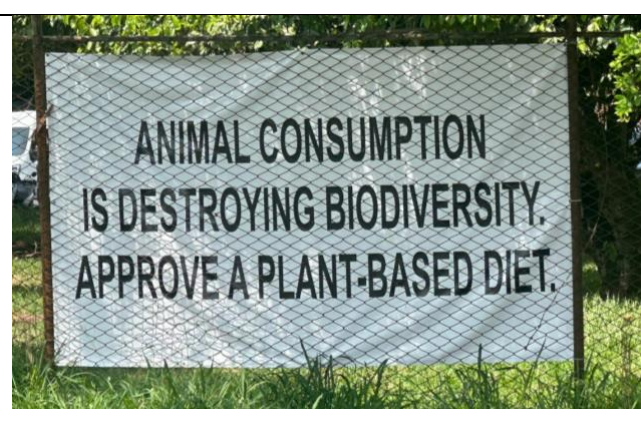
They probably mean fossil fuels.