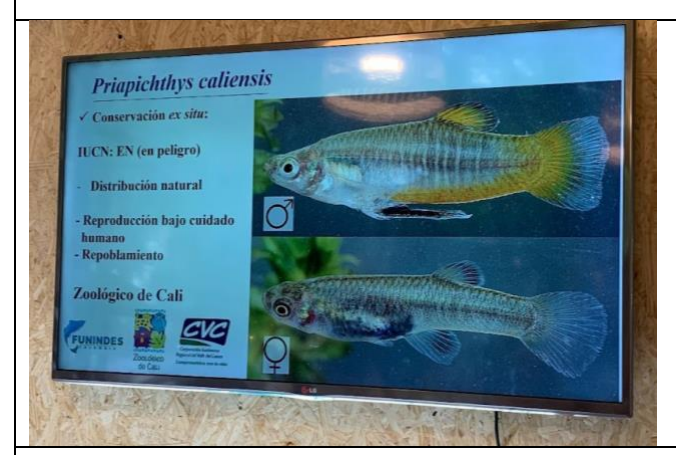
Out and about in the Green Zone: endemic fish Priapichthys caliensis , known from a mere 25-yard stretch upstream from the Cali river.