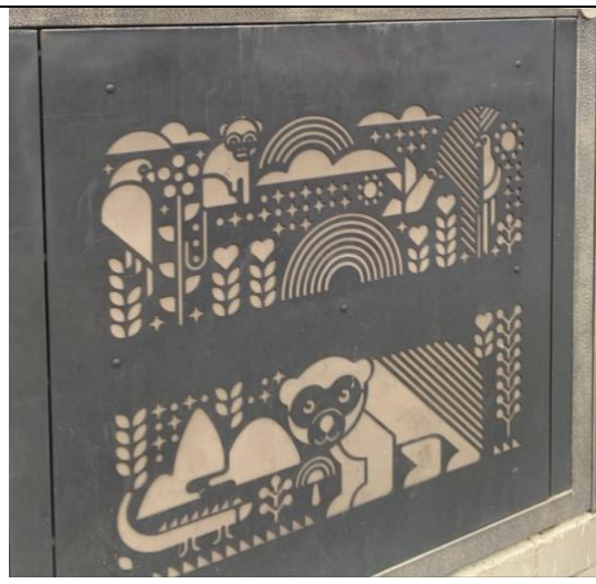
Out and about in the Green Zone: service vents along the river park also featured biodiversity, in the case the Andean bear.