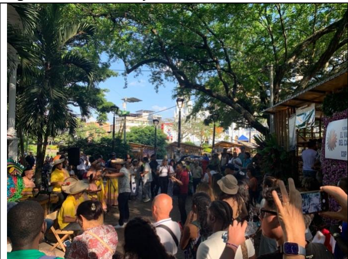
Out and about in the Green Zone: a giant block party along the Cali River.

caliensis found individuals only along 25-m of one of the Cali River's tributaries. This is only known thanks to a small local NGO called <u>Funindes</u>, which has a backlog of many other species to monitor. There were sobering exhibits. For example, the cemetery of recently extinct species showed species lost to the world as recently as the 2000s, in places as disparate as the Hawaiian archipelago, Tasmania, Costa Rica, or the Galapagos. But not all is lost, the garden of second chances features the many species that have been rescued from the brink of extinction by conservation action, including the iconic American bald eagle, or the Iberian lynx.