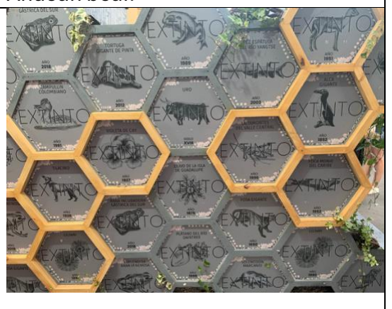
Out and about in the Green Zone: a cemetery of recently extinct species, some within the last 20 years.