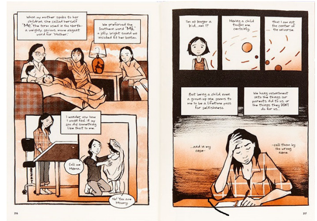
The Best We Could Do, Thi Bui

The cultural significance of comics emerges not just out of the super-hero genre or comics as children's literature, but from political cartooning and critically acclaimed graphic memoirs such as Art Spiegelman's Maus or Marjane Satrapi's Persepolis . This course will consider the dual potential of the comic medium: comics as method, as well as comics as literatures of resistance.