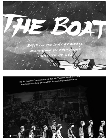
Ebony Flower's Hot Comb and Matt Huynh's The Boat

Apart from graphic memoirs such as Thi Bui's The Best We Could Do , we will also examine short comics such as Ebony Flower's Hot Comb , and interactive motion comics like Matt Huynh's The Boat . The goal of this class is to not just study comics as literature, but to consider the visual grammar of the comics medium. Students will have the option of turning in a multi-modal project in lieu of a final paper.