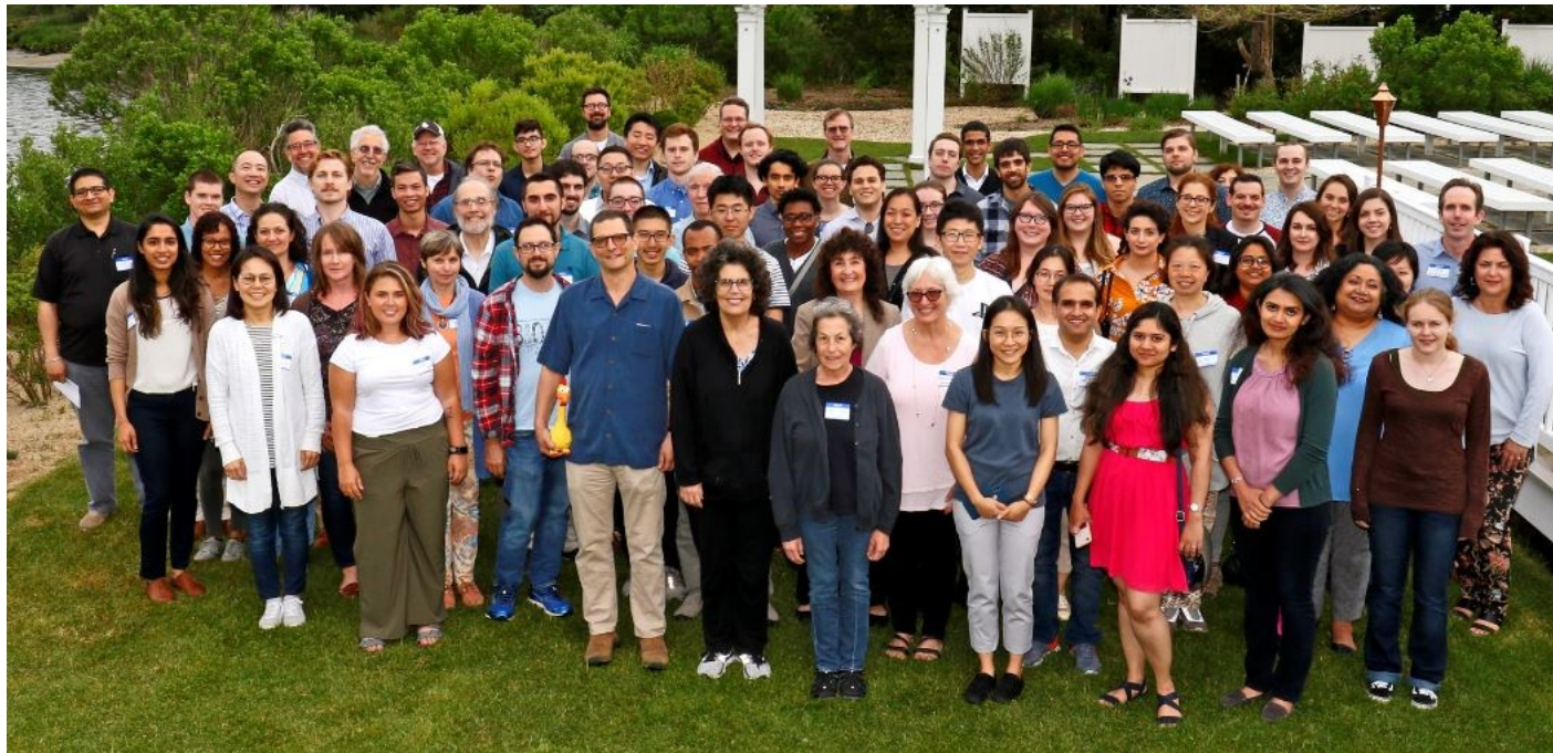
Faculty and graduate students at the annual retreat.